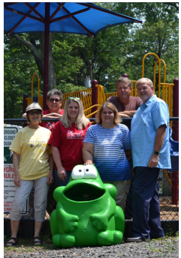
Right: Recycling bin donation from Keep Manassas Beautiful