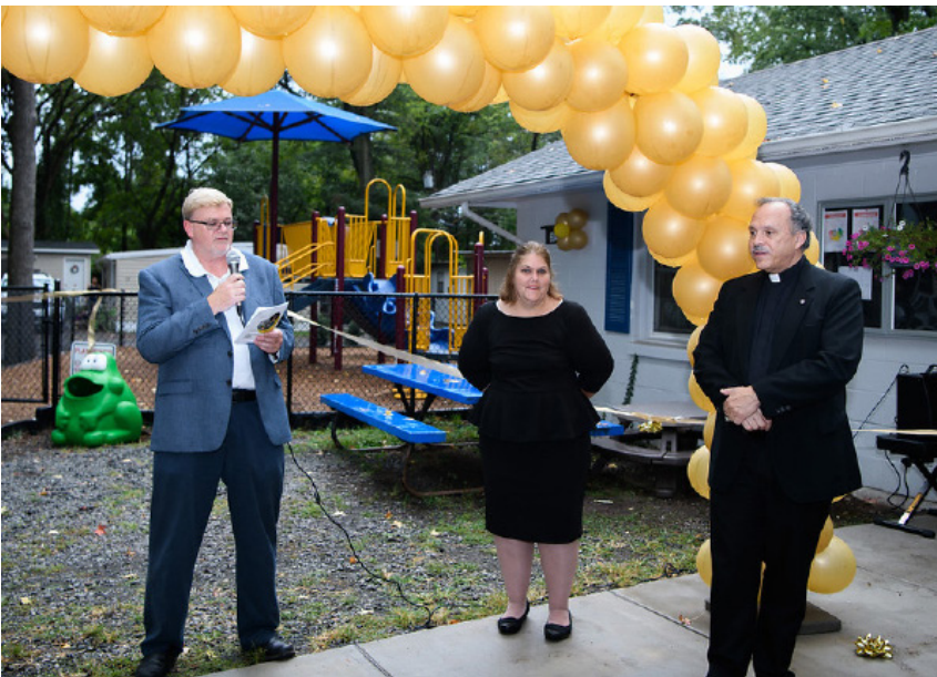
Above: East End playground dedication ceremony

Our successes at East End have come with recognition by the broader community of the importance of efforts such as ours. This summer, Virginia gubernatorial candidate Terry McAuliffe chose East End as the exemplary location from which to announce the tenets of his affordable housing program. Most importantly, we have strengthened our ties with the residents who are the heart and soul of the community, and we are greatly looking forward to a collaborative 2022.