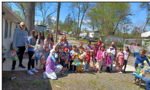
Children's Programs at East End

CFH provides emergency assistance for income-fragile seniors to allow them to live independently.