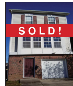
First Time Buyer Home