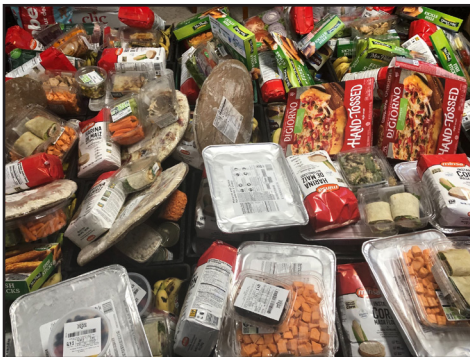
Organizing Food Distribution

Developer of affordable homes Manager of rental units Creator of first-time buyer and renter opportunities Administrator of housing programs Distributor of food to local families Provider of help for seniors in need Part of the solution as an active member of the Northern Virginia housing community