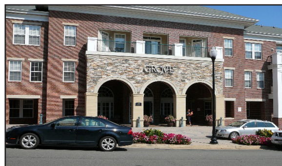
Grove at Arlington