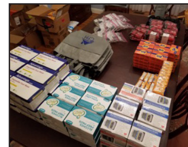
Senior Emergency Help