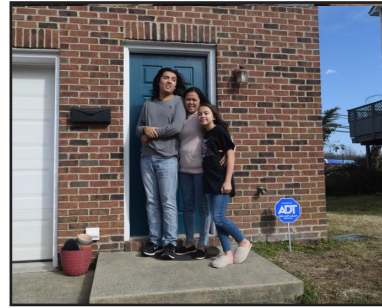
Family of New Homeowners

CFH is a 501(c)3 charitable organization whose mission of providing and promoting housing stability is accomplished thanks to grants and generous contributions.