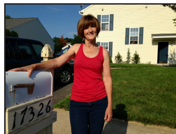
Downpayment Assistance Recipient