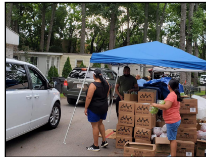
Food Distribution in Manassas

For more information about our programs or to make a contribution to our efforts, please visit our website at cfhva.org .