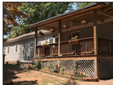
Mobile Home Park Management